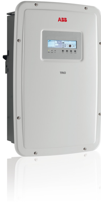
ABB string inverters TRIO-5.0-TL-OUTD 5.0 kW

The all-in-one, residential, three-phase TRIO-5.0 kW inverter deliver performance, ease of use and installation, monitoring and control. With their 98% peak efficiency and wide input voltage range, these new residential TRIO inverters mean flexible installations and powerful output.